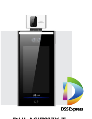
DHI-ASI7213X-T THERMAL FACE RECOGNITION READER - 13176

Wall Mounted Temperature Accuracy: ±0.3°C Temperature Monitoring Distance: 0.3m~0.8m Sound Prompt : Abnormal temperature alarm