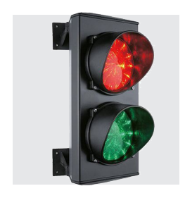
DEA TRAFFIC LIGHT RED/ GREEN LIGHTS 230V - 30005