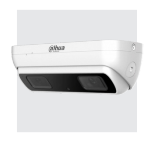
IPC-HDW8341XP-3D 3MP IP AI PEOPLE COUNTING CAMERA - 10166

Multiple network monitoring: Webviewer, CMS & DMSS 2.8mm dual lens Max. IR LEDs length 10m People Counting: Supports line crossing people counting, region people counting Mounting Accessories (Included): Quick mounting board