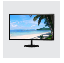
DHL22-L200 21.5" FULL HD & VGA LCD MONITOR - 12100