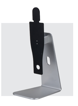
ASF072X-TI DESK MOUNT STAND - 13179